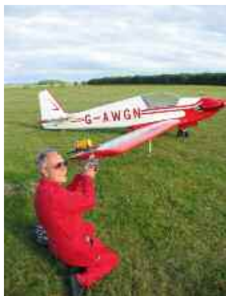
Wingtip generators that make coloured smoke are a must

“As with after dinner speeches, brevity is paramount. Stop with the crowd wanting more - don't wait until they've wandered off for another ice cream”