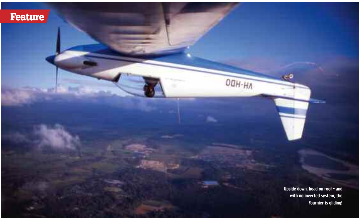
Upside down, head on roof - and with no inverted system, the Fournier is gliding!

“As with after dinner speeches, brevity is paramount. Stop with the crowd wanting more - don't wait until they've wandered off for another ice cream”