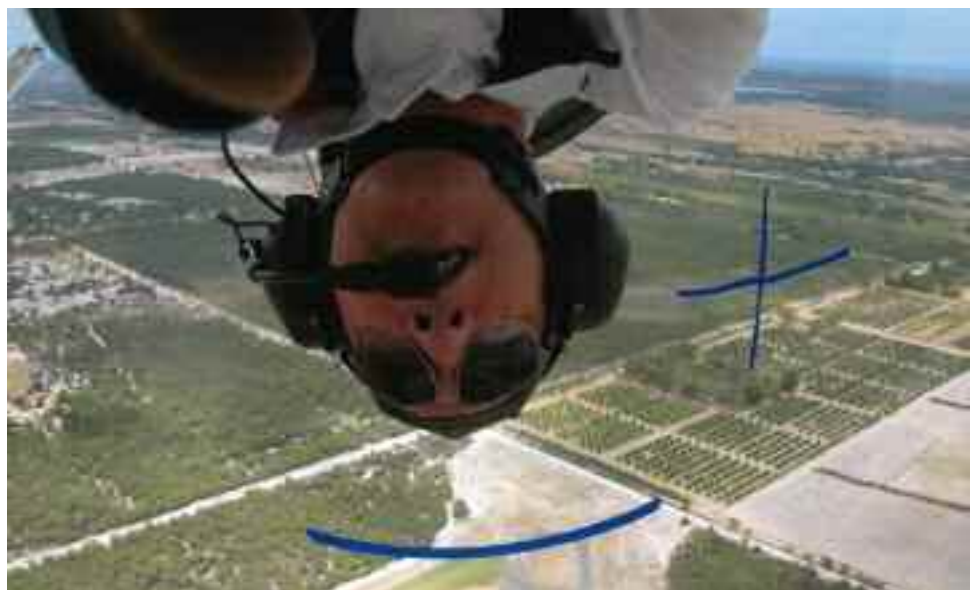
Coloured tape stuck to the inside of the canopy can be used to mark the inverted horizon or an accurate 45 degree line