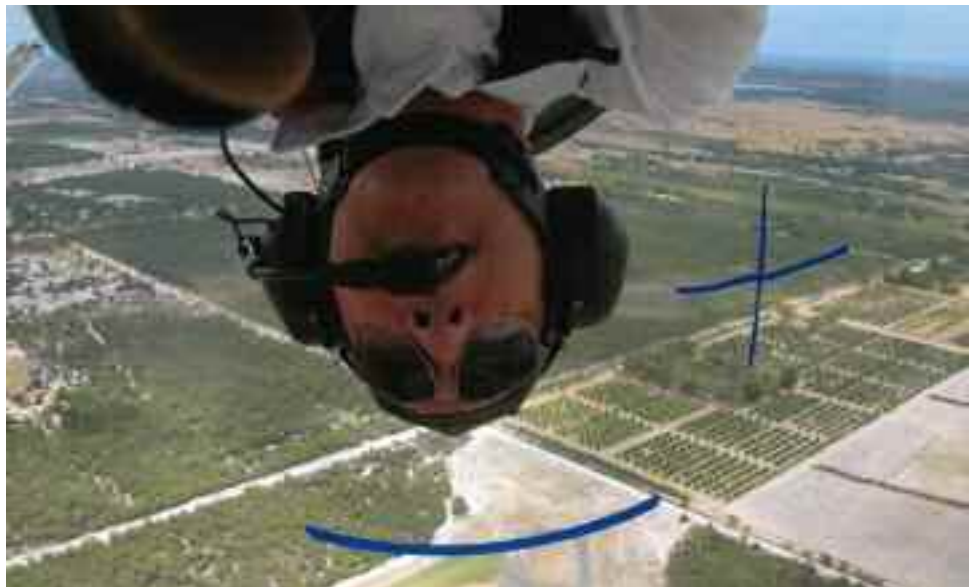
Coloured tape stuck to the inside of the canopy can be used to mark the inverted horizon or an accurate 45 degree line