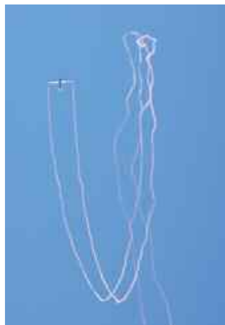
Smoke won't lie, and here it shows a perfect stall turn

“As well as performing side to side, include some manoeuvres towards and away”