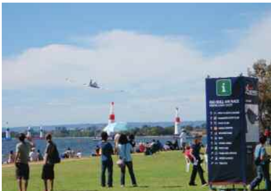
Running in low at the end and rocking the wings to say goodbye is showmanship as old as aviation - and it works

My routine is optimised for an 800-metre display line, but some are shorter, while many are longer. Several regular display sites have angled or even right-angled display lines, so you might choose to modify your standard routine accordingly.