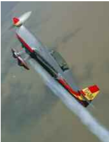
Additions like music and smoke can transform a display

“ Spectators should not have to lift their heads more than 45 degrees, nor pan sideways over 60 ”